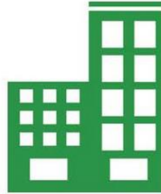
HEATING & COOKING